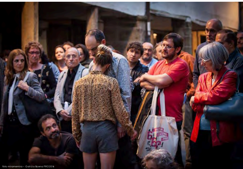
Galicia Escena PRO2016