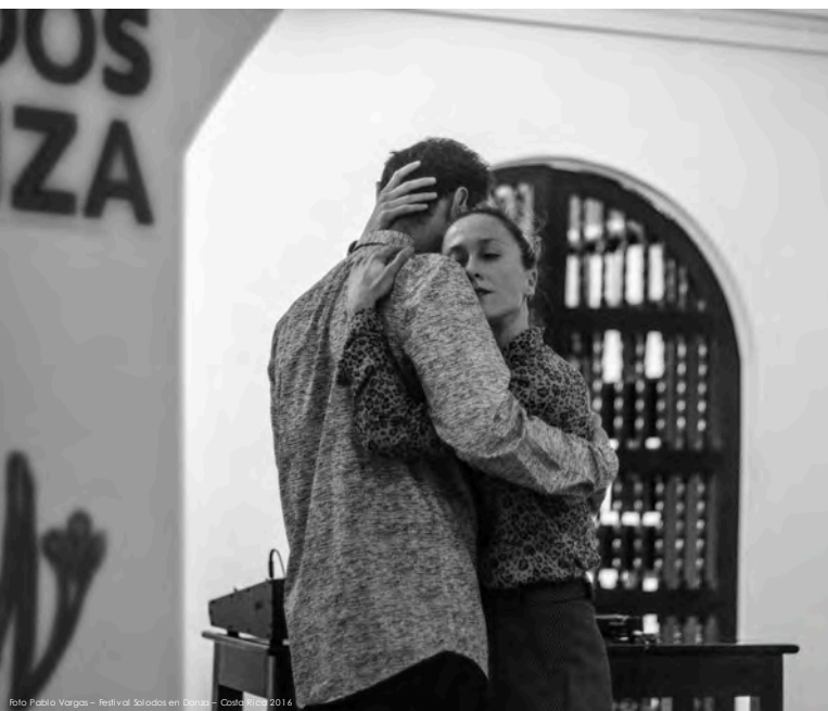
Festival Solados en Danza - Castro 2014

The cultural reality he live in and his knowledge have led him to promote and cooperate in different projects such as "República Disco Apocalipso", "Soundiggers and Soundkilla Crew". It has to be emphasized his collaboration in "Os Atardeceres do Gaiás", "Festival Curtocircuito", "Festival 58", "Carballo Interplay", "Foundation Reggae Fetsival", "Vibra Balboa", "Reperkusion" and clubs such as "Le Club", "El 14!", "Patachim", "La Huelga", "Jaranaclub" and "Puticlú" among others.