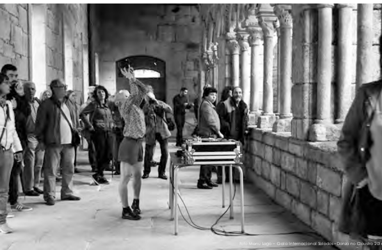
Gala Internacional Solados-Danzas no Castro 2016