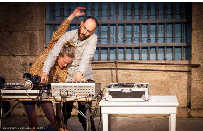
Galicia Escena PRO 2016

GIVE IT A SPIN is a new proposal by Pisando Ovos for non-convetional spaces where music and movement, in their pure states, meet through the dialogue between a dancer and a DJ.